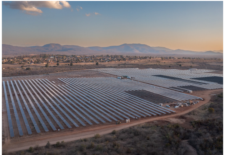
Bolobedu, South Africa | 148 MW

SPRING is primarily based on a clear strategic refocus on Development and Energy Sales activities, as well as on the geographies and technologies that generate the highest value. Voltalia has therefore decided to divest or discontinue development activities in five countries and to focus its investments on solar, onshore wind and battery storage. The disposal of non-strategic assets planned between 2026 and 2028 is expected to generate between €300 million and €350 million, supporting a return to positive net income as early as 2026 and a gradual deleveraging trajectory.